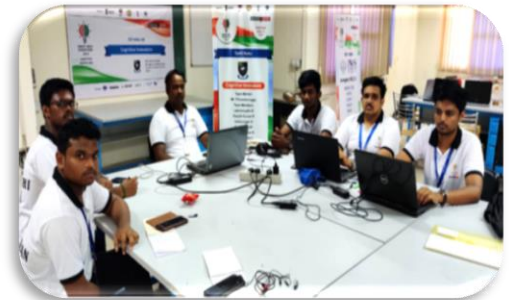
National Level Project Competition – Smart India Hackathon (SIH) – Finalist, 2019.