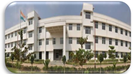
R.M.K. COLLEGE OF ENGINEERING AND TECHNOLOGY