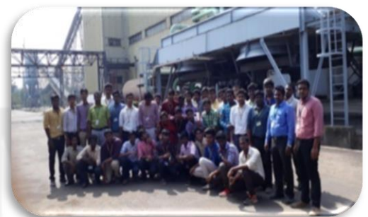
Industrial Visit to Core Companies

Industry Consultancy Worth of Rs. 6 L Since 2018