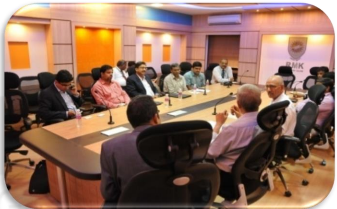
Interaction with Core Companies – TAFE, Lucas TVS, Ashok Leyland.