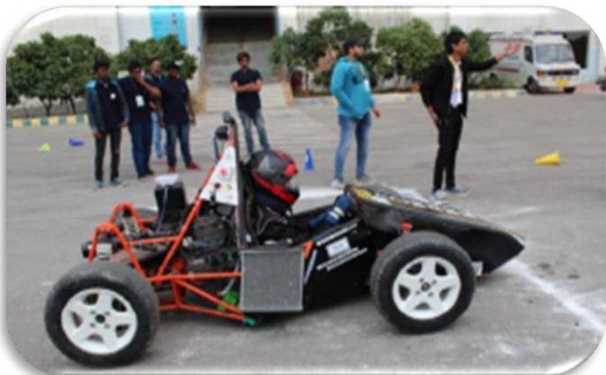
HYBRID VEHICLE CHALLENGE by ISIE- IMPERIAL SOCIETY OF INNOVATIVE ENGINEERS at Galgotia University, Greater Noida during 2019.