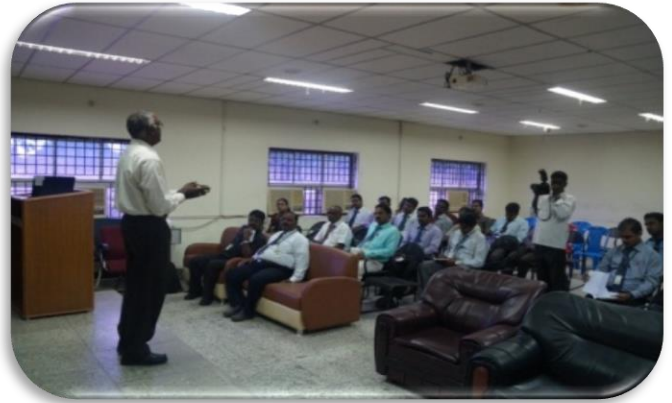
PLM - CoE Training with Industrial Experts