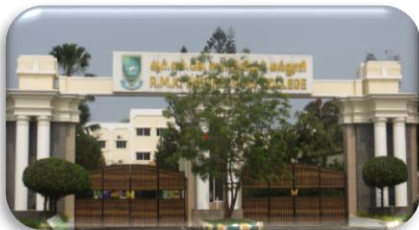
R.M.K. ENGINEERING COLLEGE