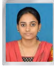
LOGANAYAKI T (2012-16 Batch)