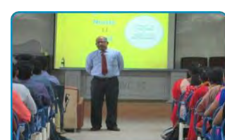
Guest Lecture by L&T Expert