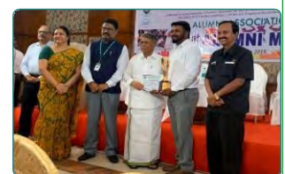
Distinguished Alumni Award