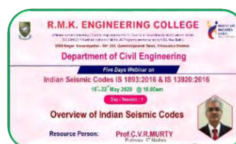
Five days webinar on Revision of India Seismic codes