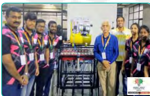
SIH 2019 Grand Finale Hardware Edition @ IIT Bombay.