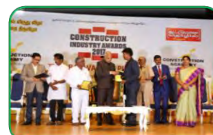
Excellence in Civil Engineering – Construction Industry Award 2017