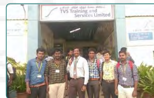
E-Cell Members' visit to TVS Training & Services Centre.