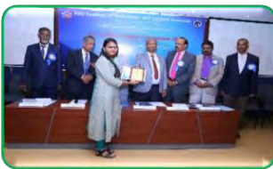
ISTE Best Student Award 2019 19th ISTE TN Section Annual convention.