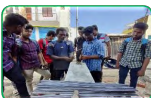
Students exposed to field construction practices through Internship