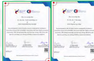
40 students certified by MHRD Innovation cell on Innovation, Entrepreneurship and IPR