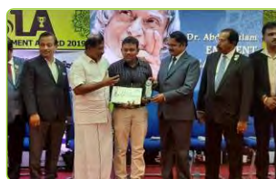
IEI TESLA Research Innovation Award